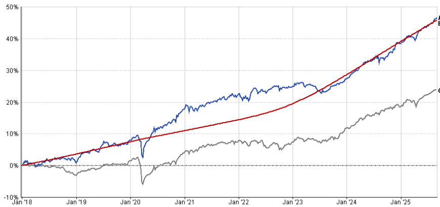
■ A - Apollo Diversified Multi Strategy Portfolio 11/04/2025 TR (46.56%) ■ B - Bank Of England Base Rate + 3% TR in GB (45.84%) ■ C - IA Targeted Absolute Return TR in GB (23.87%)

The Apollo Diversified Multi Strategy Portfolio aims to blend a diversified selection of strategies together in a single portfolio. The portfolio will invest in strategies that historically have shown a low correlation to equity and bond markets. The portfolio will aim for annualised returns in excess of Cash + 3% over the medium to long term. To achieve this enhanced return, the portfolio will invest in asset classes which may introduce fluctuations in capital value over the short term, and positive returns are not guaranteed.