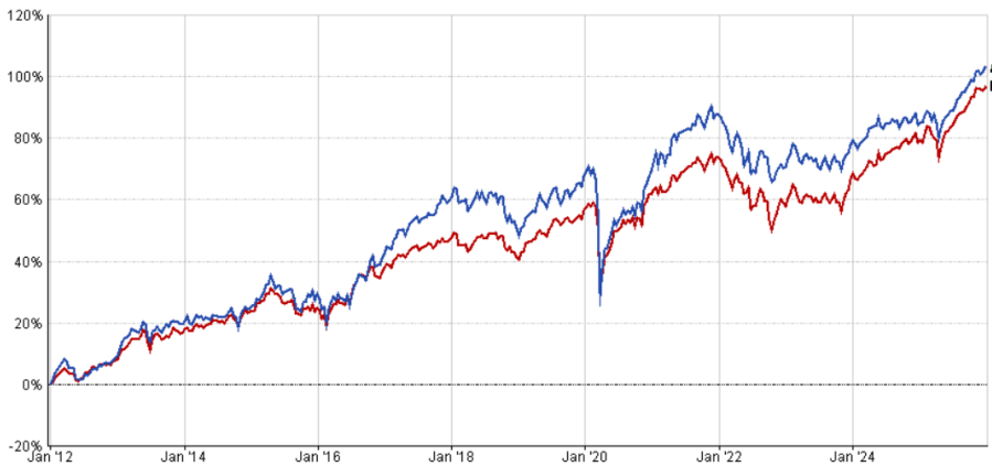
■ A - Athena Controlled Risk Portfolio VI 04/04/2025 TR (103.49%) ■ B - IA Mixed Investment 20-60% Shares TR in GB (96.93%)

Source: Financial Express 31.12.11 to 31.12.2025 Performance calculated for Athena Active Balanced (Athena VI) is the total return net of all underlying fund charges and gross of other fees and is based on Apollo's central 'core/satellite' portfolio strategy. Actual performance may vary depending on adviser charges, the platform selected and on fund availability. The representative sector for reference only is IA Mixed Investment (20-60%). Ratios are calculated on a monthly basis.