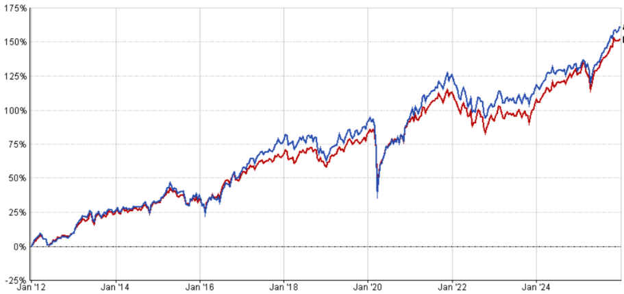
■ A - Athena Controlled Risk Portfolio VIII 04/04/2025 TR in GB (161.52%) ■ B - IA Mixed Investment 40-85% Shares TR in GB (152.62%)

Source: Financial Express 31.12.11 to 31.12.2025 Performance calculated for Athena Active Growth (Athena VIII) is the total return net of all underlying fund charges and gross of other fees and is based on Apollo's central 'core/satellite' portfolio strategy. Actual performance may vary depending on adviser charges, the platform selected and on fund availability. The representative sector for reference only is IA Mixed Investment (40-85%). Ratios are calculated on a monthly basis.