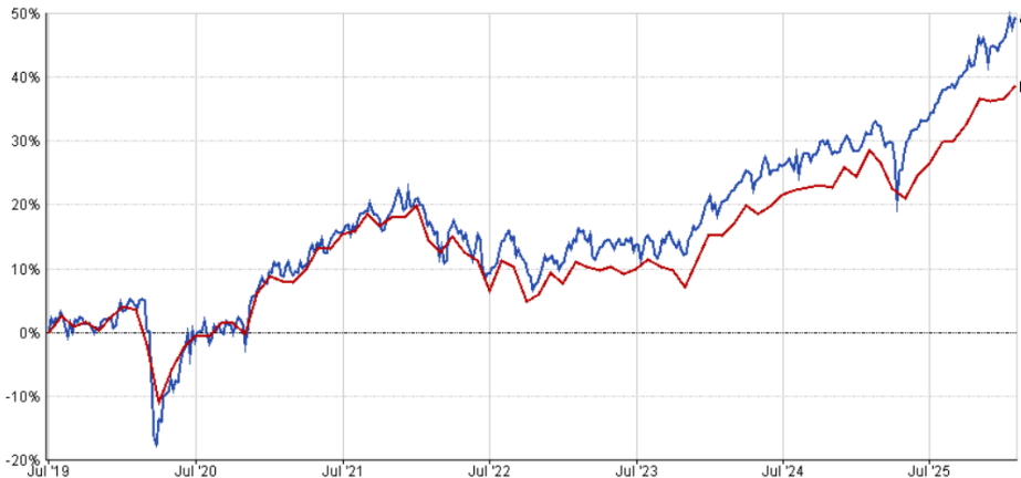
A - Apollo Index Growth Portfolio 30/06/2020 TR (49.46%) B - ARC Sterling Steady Growth PCI TR in GB (38.73%)