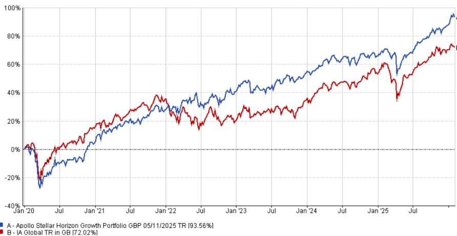
A - Apollo Stellar Horizon Growth Portfolio GBP 05/11/2025 TR (93.56%) B - IA Global TR in GB (72.02%)

Performance data includes a back-tested performance over three years, the portfolio was launched on 30.06.23. Performance calculated for the Apollo Stellar Horizon Growth Portfolio is net of underlying fund charges and gross of other fees. Actual performance may vary depending on adviser charges, the platform selected and on fund availability. The benchmark for the Apollo Stellar Horizon Growth Portfolio reference only is the IA Global sector.