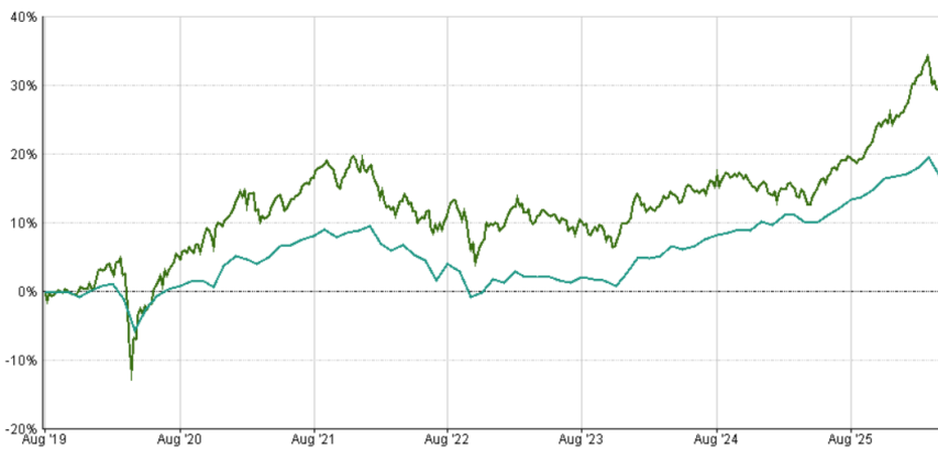
■ A - Apollo Sustainable Cautious Portfolio 26/08/2025 TR (29.49%) ■ B - ARC Sterling Cautious PCI TR in GB (16.76%)