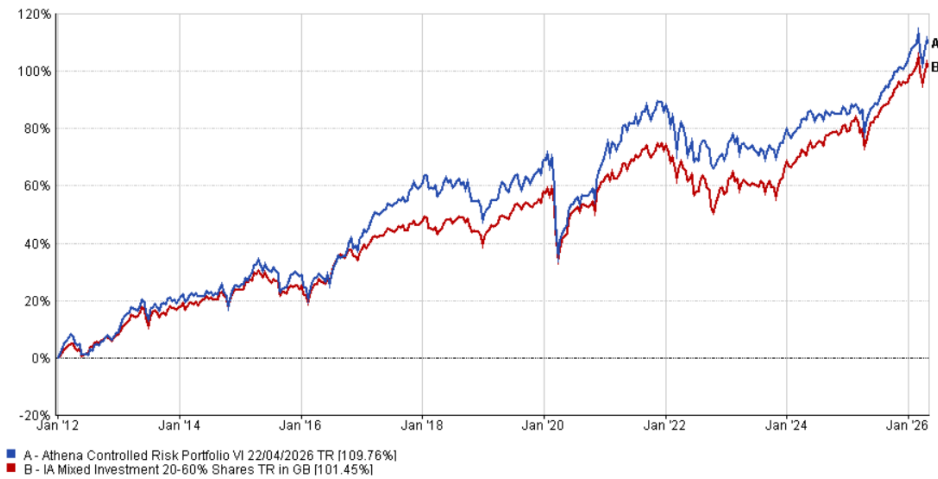
Source: Financial Express 31.12.11 to 30.04.2026 Performance calculated for Athena Active Balanced (Athena VI) is the total return net of all underlying fund charges and gross of other fees and is based on Apollo's central 'core/satellite' portfolio strategy. Actual performance may vary depending on adviser charges, the platform selected and on fund availability. The representative sector for reference only is IA Mixed Investment (20-60%). Ratios are calculated on a monthly basis.